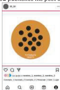
Figure 1. Phase 1.2. Social Media Post: Development and Social Media Dissemination. Student ID 32 publishes his post on Instagram.