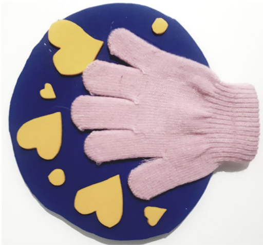
Figure 1. Partial unaffected hand containment.

changing to act as the operating hand in the last 4 weeks. For the 2 weeks of BIT in the mCIMT-B program, the affected hand was given the assisting role for the first week, and then the operating role for the second week. Some examples of activities for both therapies are shown in Table 1 and Figure 2.